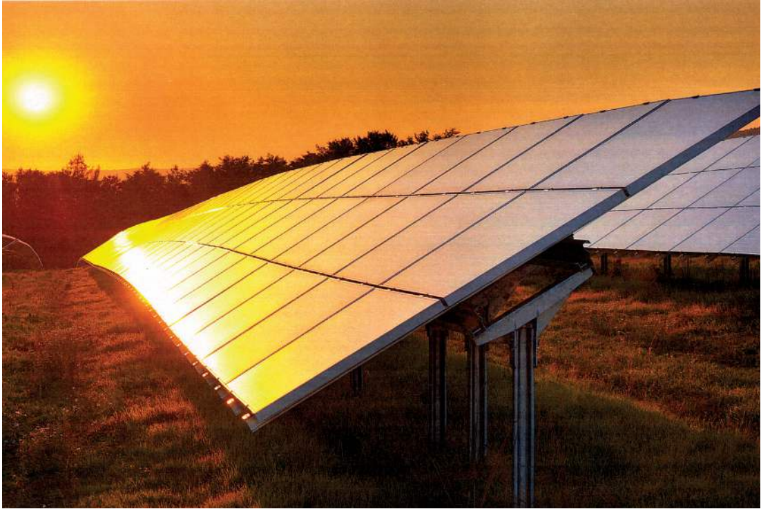
Photograph E for Question 4