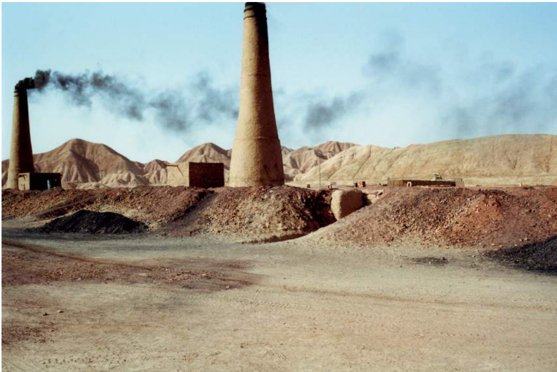
Photograph B for Question 2