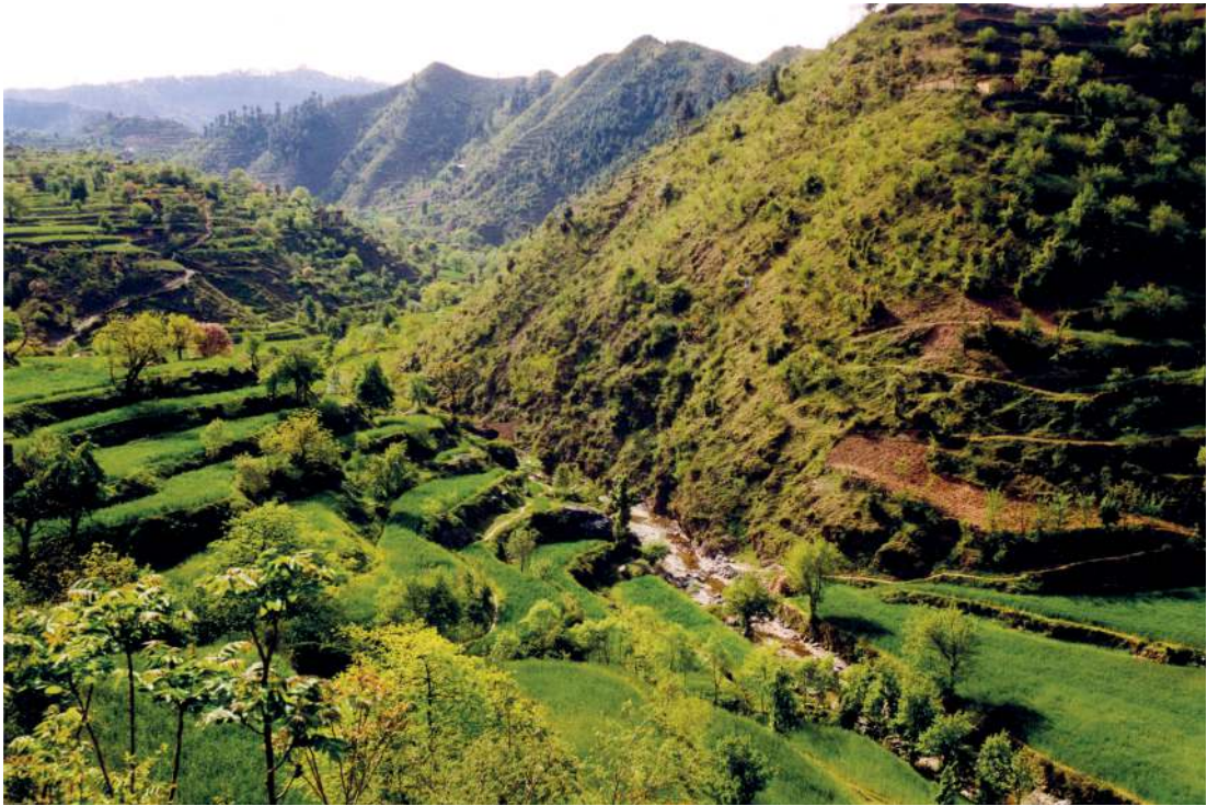
Photograph C for Questions 3 and 4