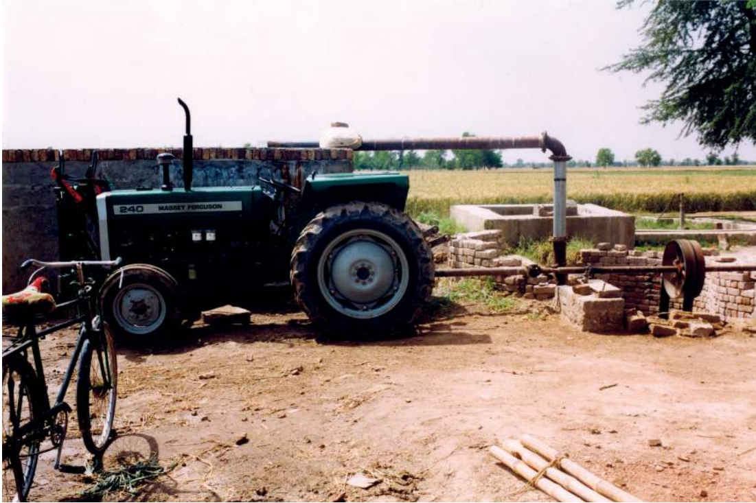
Photograph A for Question 1